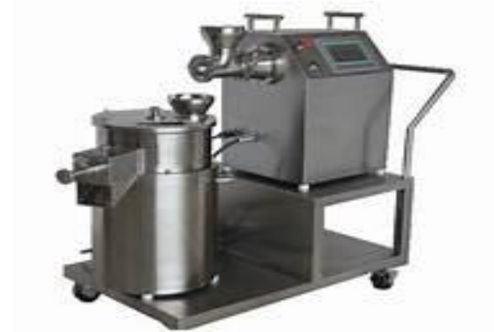
Processing Machine: Extruder & Spheroniser