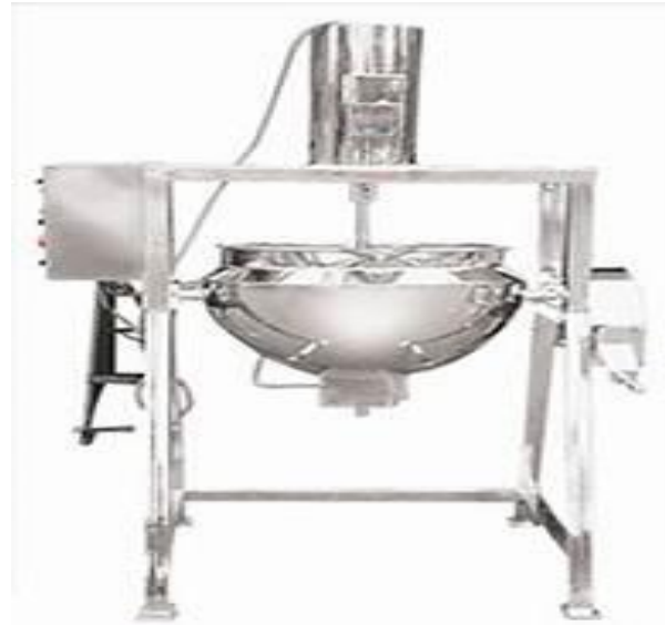
Processing Machine: Starch Paste Kettle Control: Manual Origin: India