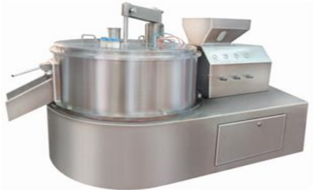
Processing Machine: Spheroniser Control: PLC Origin: India