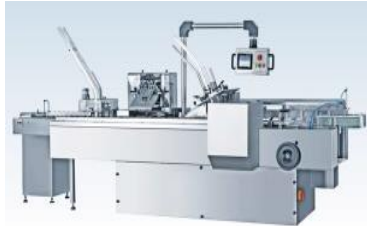
Processing Machine: Cartooning Machine