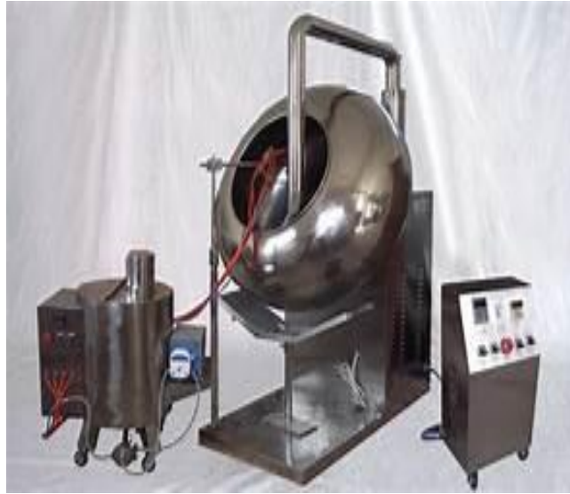
Processing Machine: Conventional Coating Pan Control: Manual Origin: India