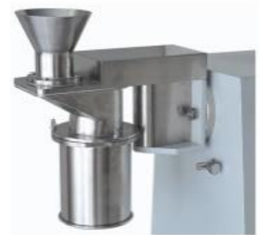
Processing Machine: Co mill For wet & Dry Application Control: Manual Origin: India