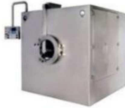
Processing Machine: Tablet Coating machine for Film & Sugar Coating Control: PLC 21 CFR Origin: India