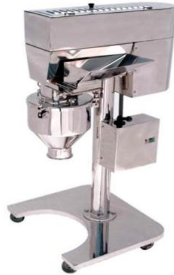
Processing Machine: Multimill Control: Manual Origin: India