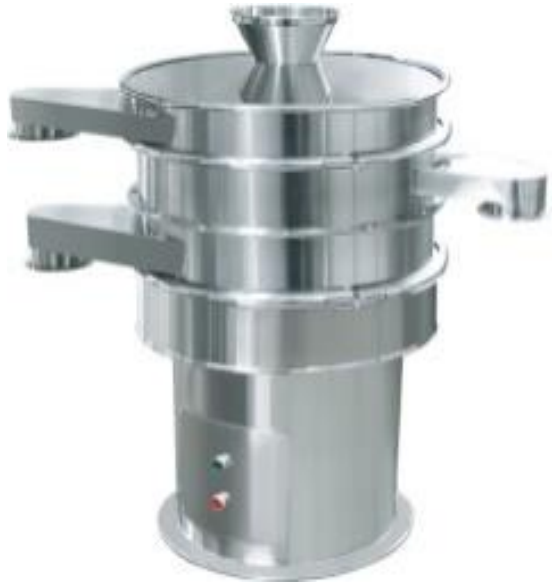
Processing Machine: Sifter Control: Manual Origin: India