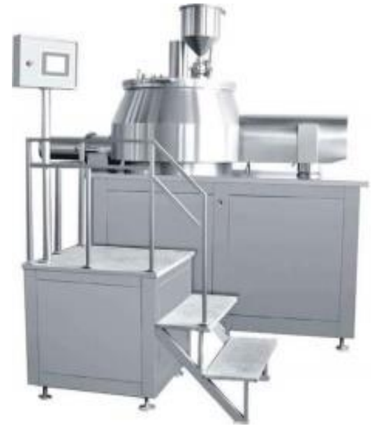
Processing Machine: High Shear Mixer Control: PLC 21 CFR Origin: India