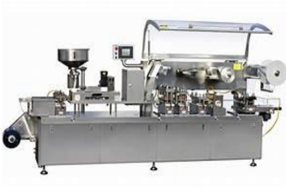
Processing Machine: Blister Pack Machine