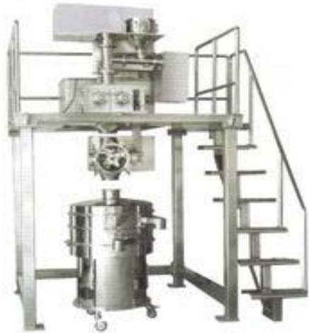
Processing Machine: Roll Compactor Control: PLC 21 CFR Origin: India