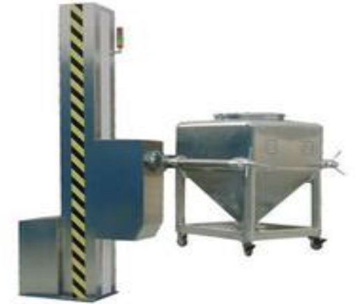
Processing Machine: Bin Blender Control: Manual Origin: India