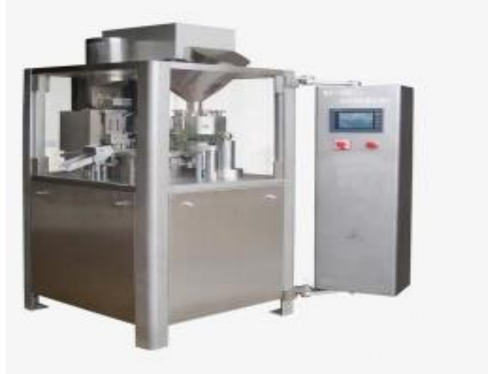
Processing Machine: Capsule Filling Control: PLC Origin: India