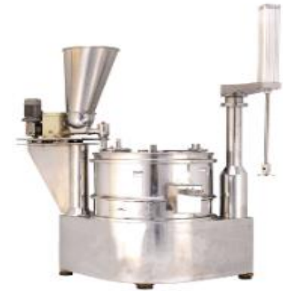
Processing Machine: Fluid Bed Tangential Spray / Drug Layering System Control: PLC 21 CFR Origin: India