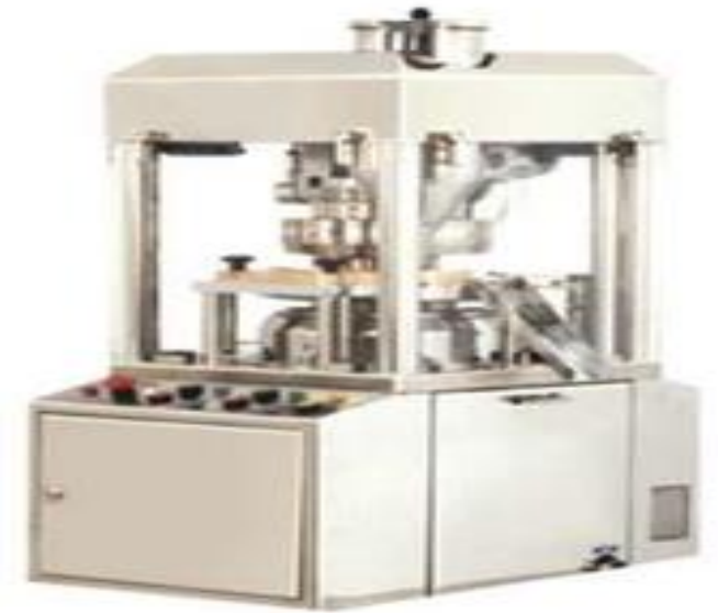
Processing Machine: Tablet Compression Control: PLC 21 CFR Origin: India