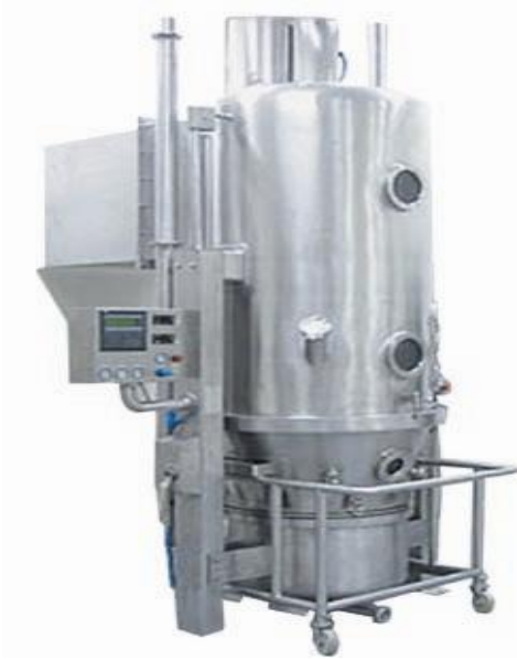
Processing Machine: Fluid Bed Processor For Wet granulation by top spray Method Control: PLC 21 CFR Origin: India