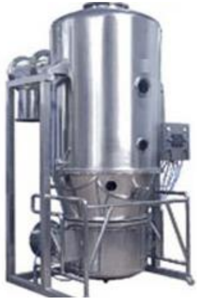
Processing Machine: Fluid Bed Drier Control: PLC 21 CFR Origin: India