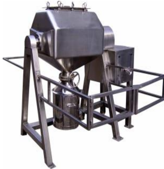
Processing Machine: Octagonal Blender Control: Manual Origin: India